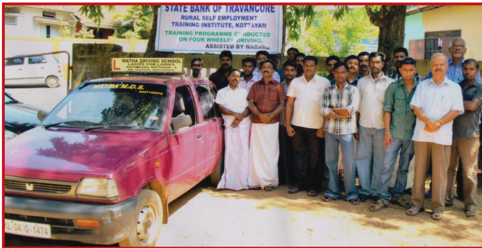
Participants of four wheeler driving training programme

State Bank of Travancore RSETI at Kottayam started functioning on 22.03.2012. The Institute has so far trained 1559 unemployed youngsters in various activities like cutting and tailoring, artificial jewellery making, beautician course, aluminum fabrication, mobile phone servicing, making soft toys, dairy farming, fabric painting, pot painting, four wheeler driving, etc. So far 1260 persons found their livelihood in the various streams in which they were trained. A special programme for HIV positive women in artificial jewellery making was conducted at Prathayasha Kendram functioning under Kerala State Aid Control Society.