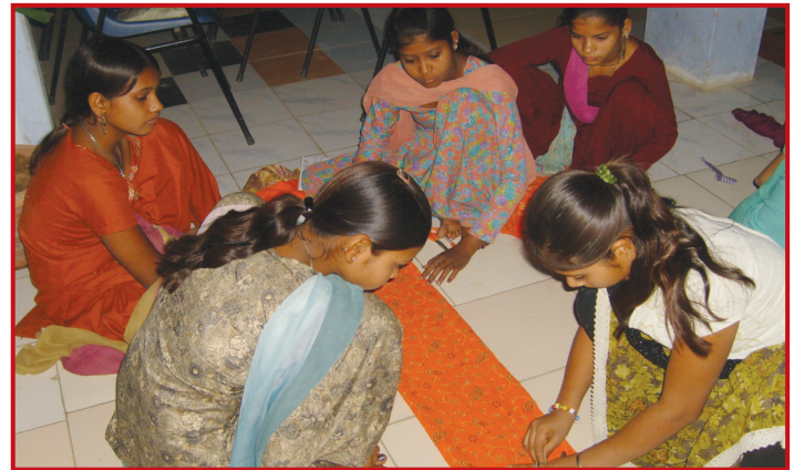
Girls from labourer's family attending tailoring program

A tailoring and dress designing training programme for women was conducted at the institute from 23.04.2012 to 26.05.2012. There were 32 participants from different villages of Samba district. The SBI RSETI Samba, was able to motivate parents of 5 girls who live with their families in close proximity of RSETI premises to allow them to attend the training so that the girls can start their self-employment units instead of working as labourers at construction sites. The girls attended the programme and learned the trade of tailoring. These 5 girls are ready to start their units and cater to the needs of their people living in the locality. We hope that this training will give these poor girls a new lease of life a life of dignity. We will make all efforts to ensure that these girls are successful in their ventures.