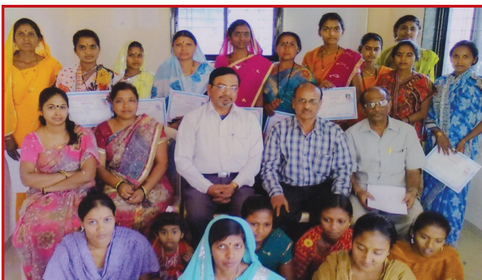
Participants of tailoring training program with Director RSETI, LDM and Bank officials

A training programme on tailoring was conducted from 24.01.2012 to 04.02.2012 for women. The programme was attended by 17 candidates out of whom 16 were from BPL. The participants were from different parts of the district. The trainees expressed that the programme was educational, and helped them to become more confident. Many of them will be starting their own tailoring shops. The trainees were also given counselling on credit linkage from the banks.