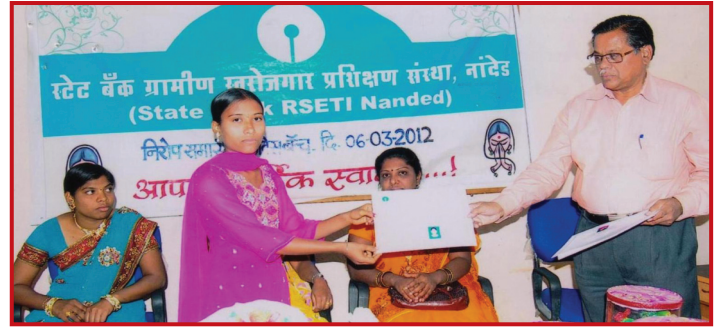
One of the trainees receiving the certificate from the guest

The State Bank RSETI Nanded, was inaugurated on the occasion of "Mahila Diwas" on 09.03.2010. The trainees were sponsored by DRDA, Nanded from BPL group. Since inception, a total of 21